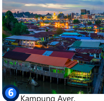
Kampung Ayer, Bandar Seri Begawan

For future information, please visit https://bruneitourism.com